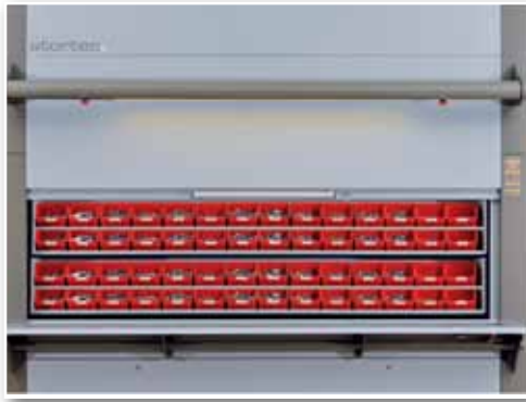
SHELVES EQUIPPED WITH INTERMEDIATE SHELVES