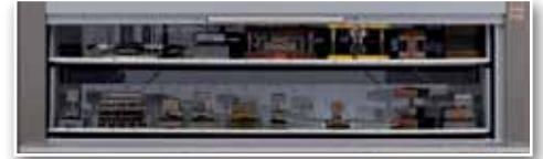
SPARE PARTS STORAGE